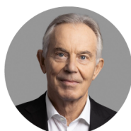
Tony Blair Institute report on personal digital health records July 2024

Bleepa® featured as key programme delivering impact under the Community Diagnostics Programme – opened national team dialogue