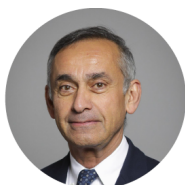
Lord Darzi report on NHS September 2024

Lays out the case for a single care record and recommends that this is built out from the current primary care record – a record that Feedback now has a minimum viable product (MVP) for with a partner