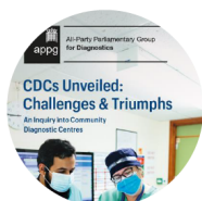
APPG for Diagnostics report on CDCs January 2024

Bleepa® featured as key programme delivering impact under the Community Diagnostics Programme – opened national team dialogue